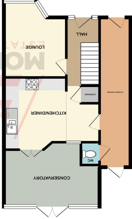
GROUND FLOOR 560 sq. ft. ( 52.1 sq. m. )