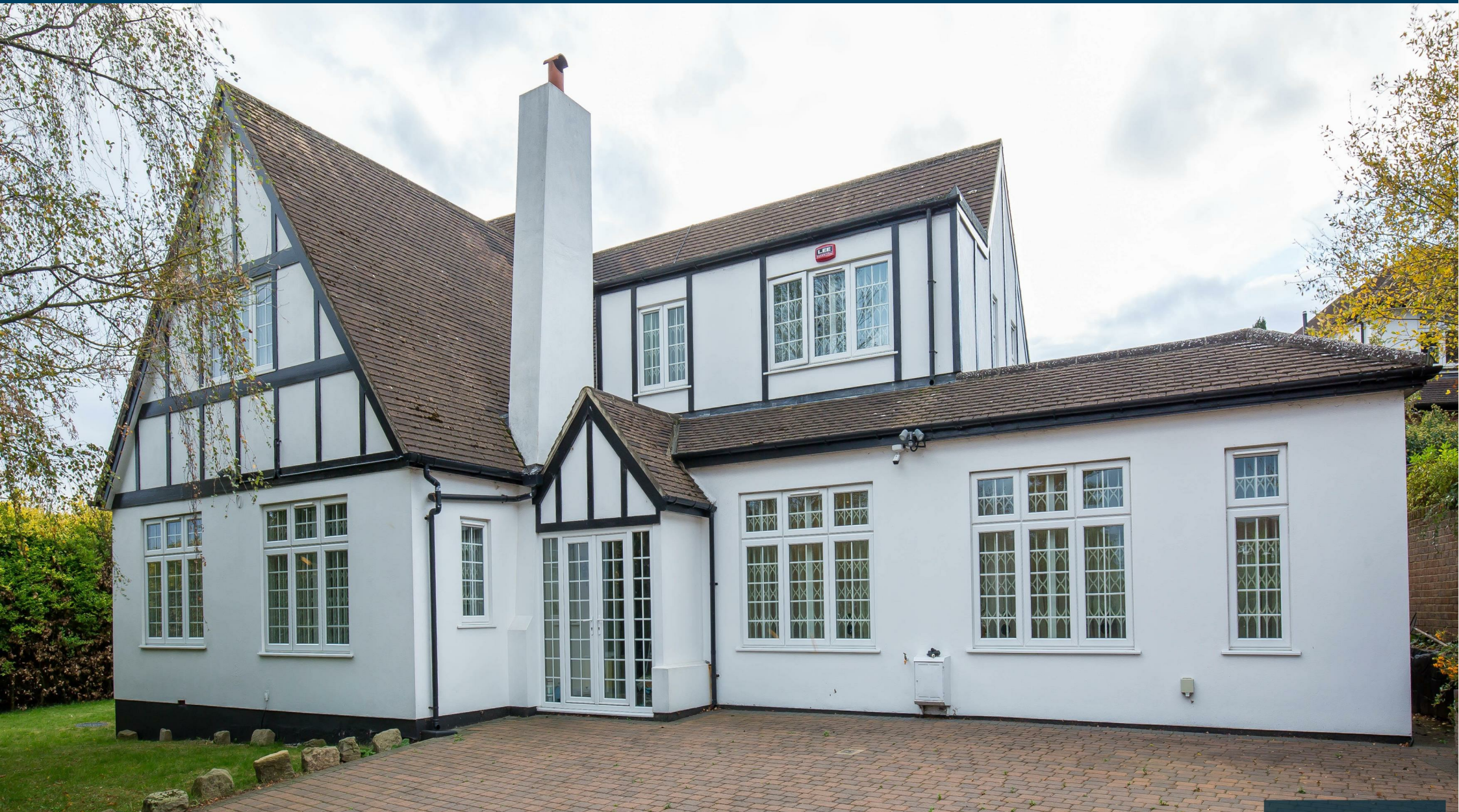
East View, Barnet Freehold

Tel: 01923 853 366 Email: info@lumleyestates.co.uk