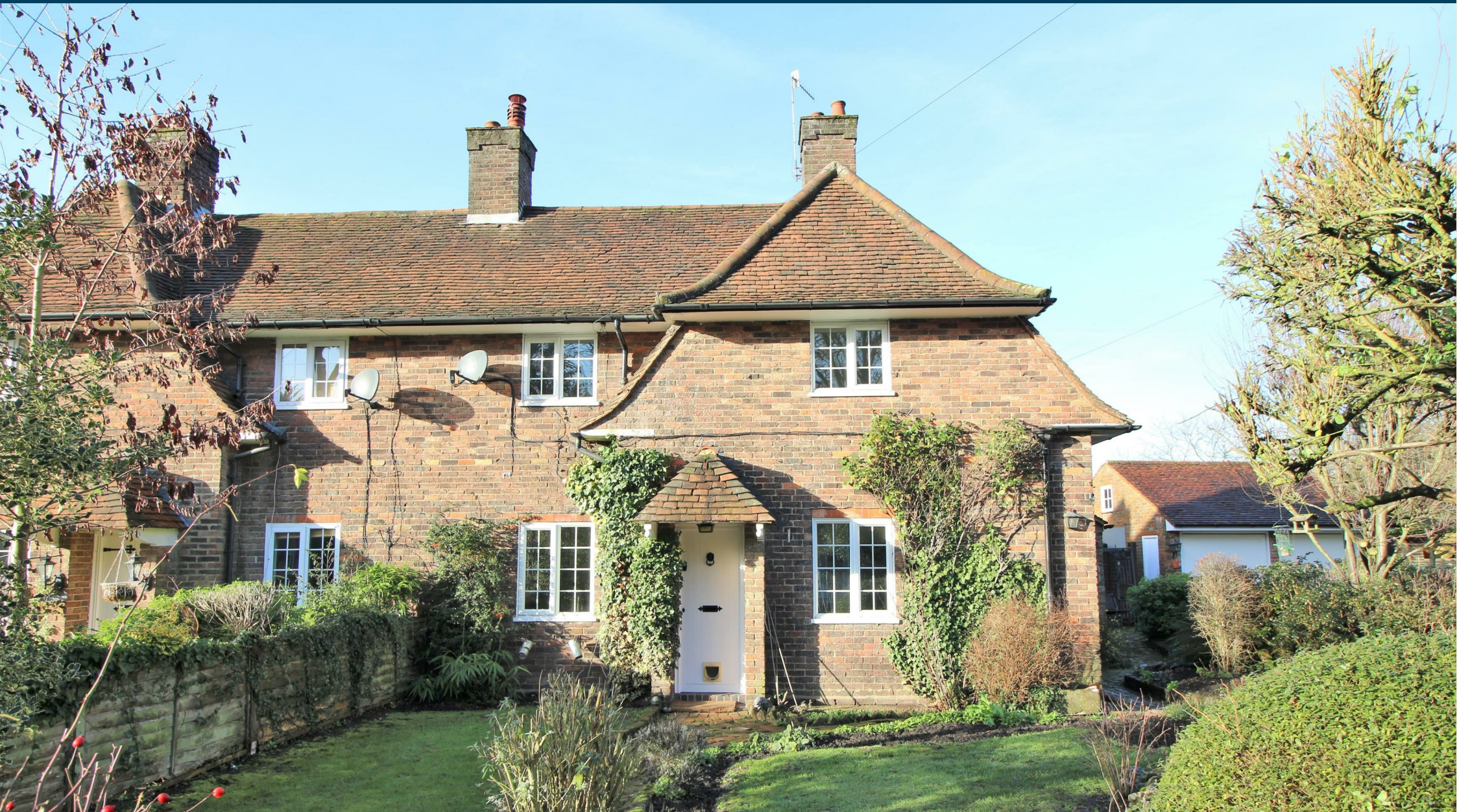
Church Cottages, Aldenham