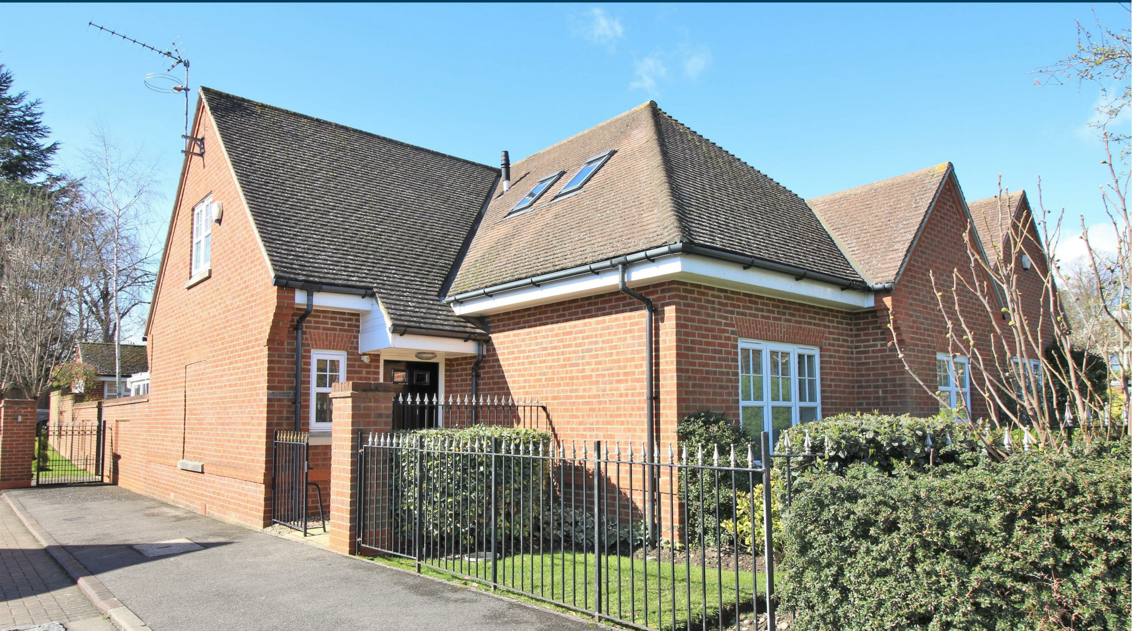
Tower View, Bushey