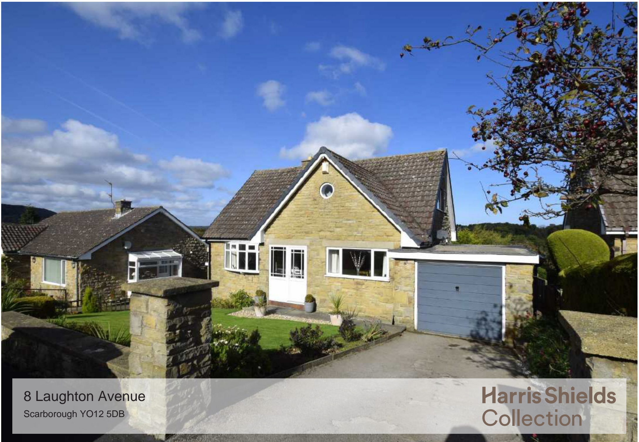
8 Laughton Avenue Scarborough YO12 5DB